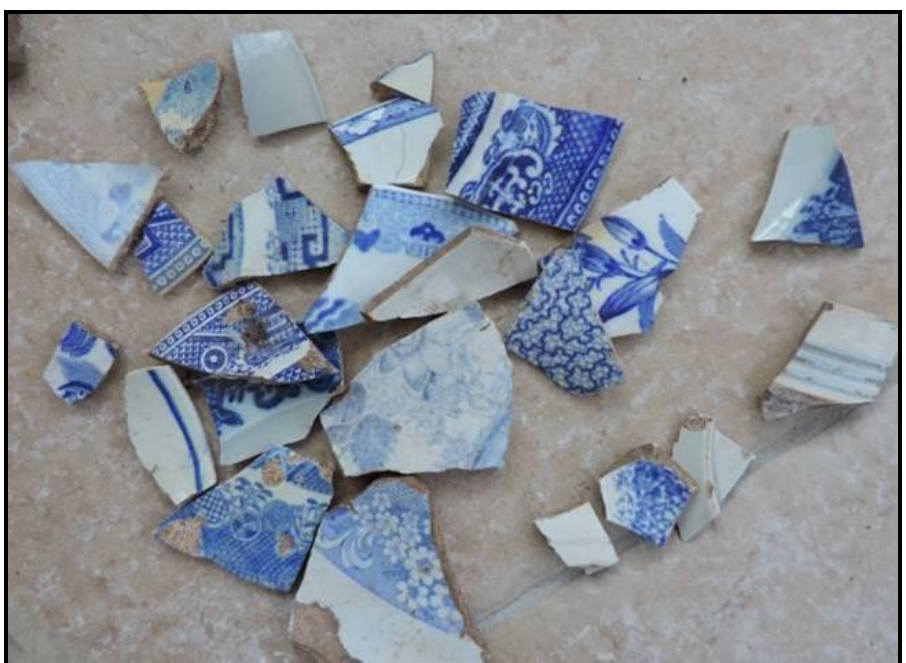
The above photographs showing various shards of pottery found adjacent to the site of a property in Elder Lane.

It is possible that the blue and white shards are China wares made at the Derby Pot - Manufactory (Cockpit Hill Pot Works).