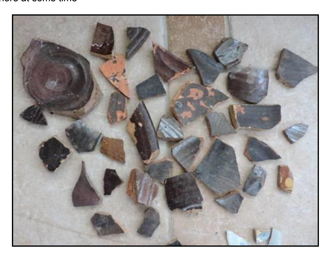
Examples of shards of pottery found in Dye House Close, Griffydam, some of which originate from Ticknall

The most common pottery shards found on the site were rims of Pancheons which are large shallow earthenware bowls or vessels wider at the top than at the bottom, and were used especially to put milk in to let the cream separate. These were probably manufactured later at Coleorton Pottery opposite the hamlet of Lount. It is thought that this pottery was likely to have been dumped there at some time