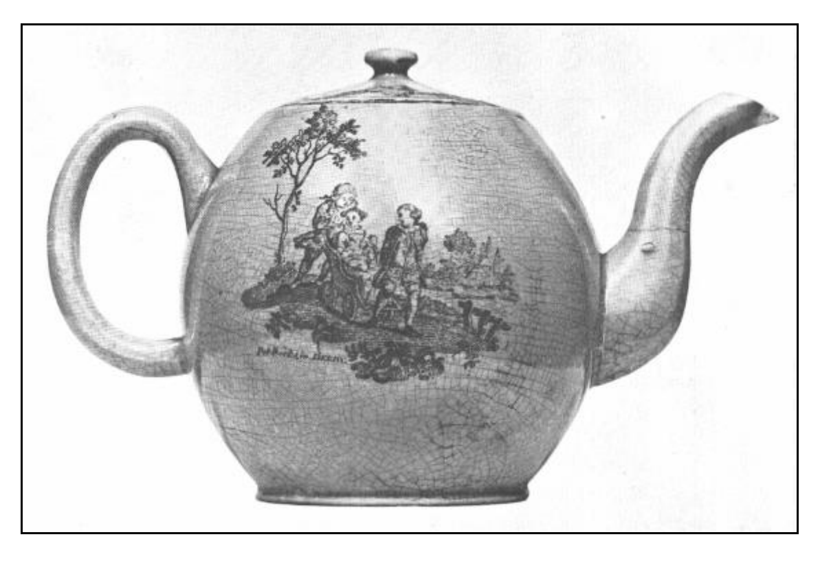
A china teapot made at Derby Pot - Manufactory / Cockpit Hill Potworks