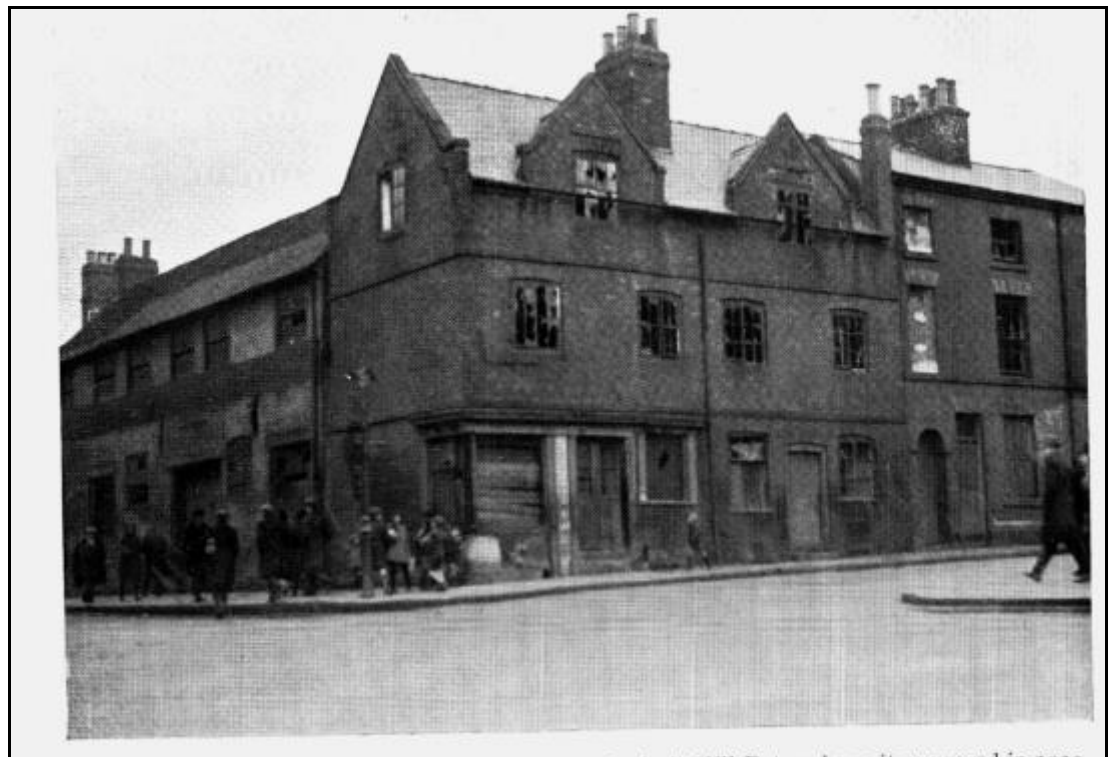
PLATE 4.—The "New House" on the site of the Cockpit Hill Potworks as it appeared in 1930. To face p. 58.